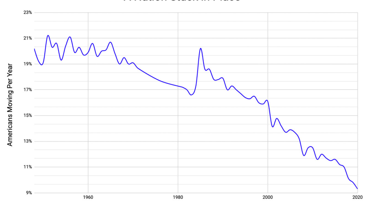
Figure 4: The percentage of Americans moving per year, 1948–2020

The line interpolates data that are missing for 1972–75 and 1977–80. (Author's chart based on U.S. Census Bureau, Current Population Survey, Annual Social and Economic Supplement 1948–2020, Table A-1. Annual Geographic Mobility Rates, By Type of Movement.)