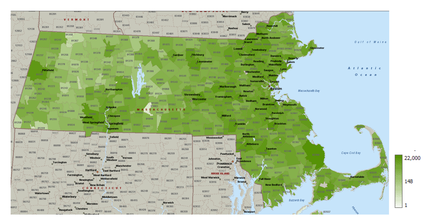
Figure 1: Geographic Distribution of Housing Transactions by Zip Code