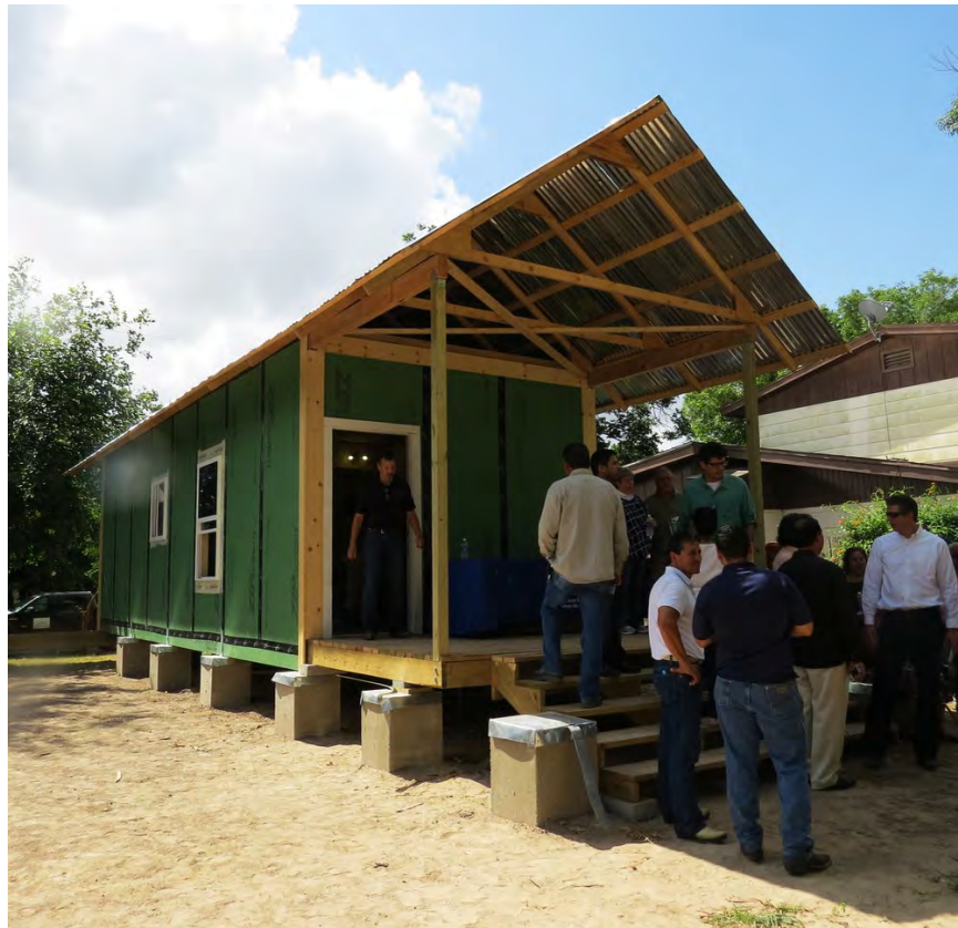
Figure 2: RAPIDO CORE Unit