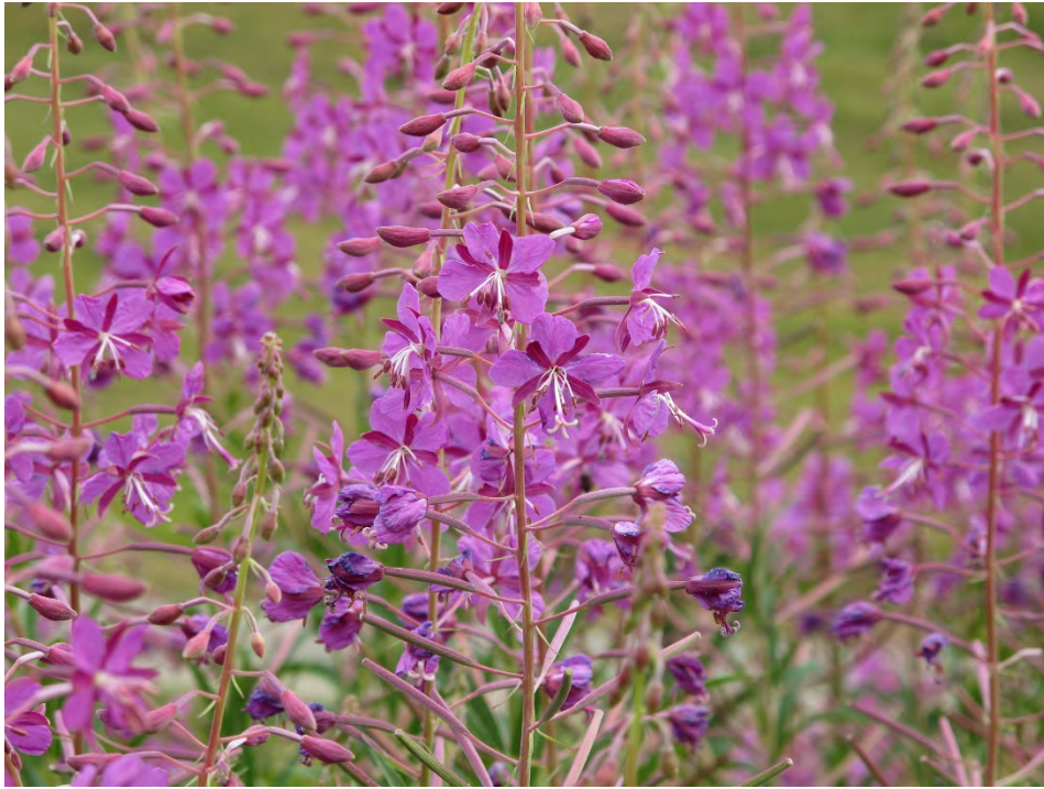
Figure 6: Fireweed, a Pioneer Species in the American West