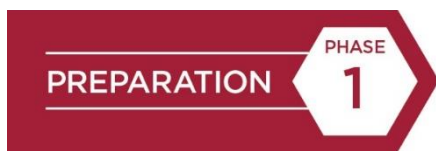
Exhibit 3: Preparation Stage Barriers and Strategies to Overcome Them

To compensate for a lack of knowledge about the homebuying process, participants took homebuyer courses offered by both non-profits and realtors. From our observations of both types of class we noted