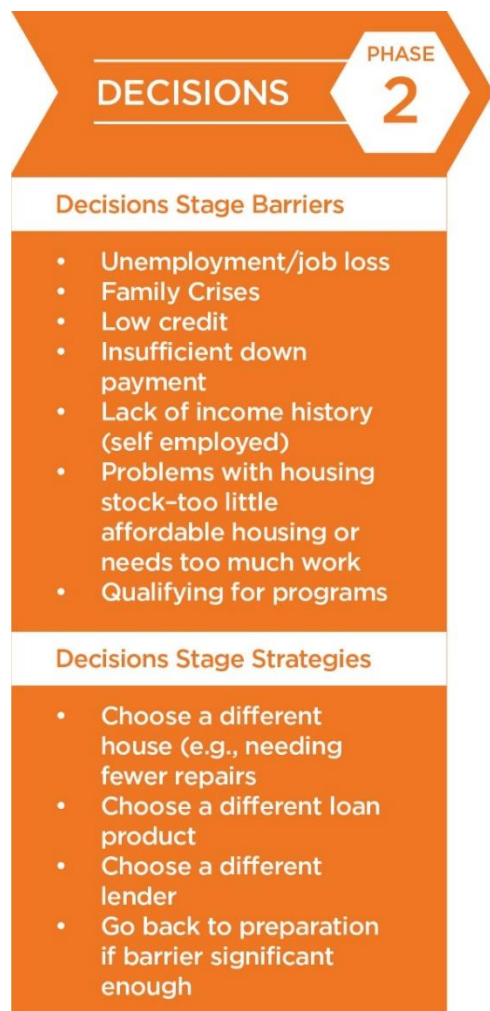
Exhibit 4: Decision Phase Barriers and Strategies