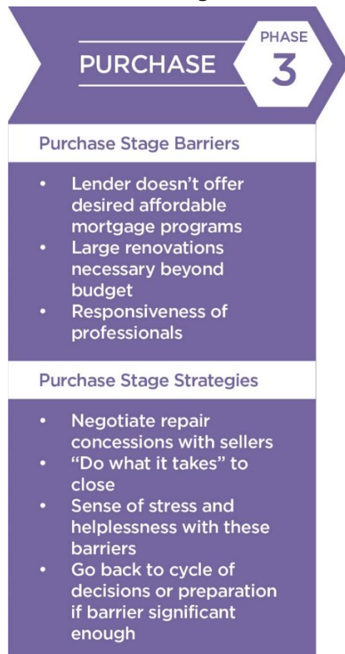
Exhibit 5: Purchase Phase Barriers and Strategies