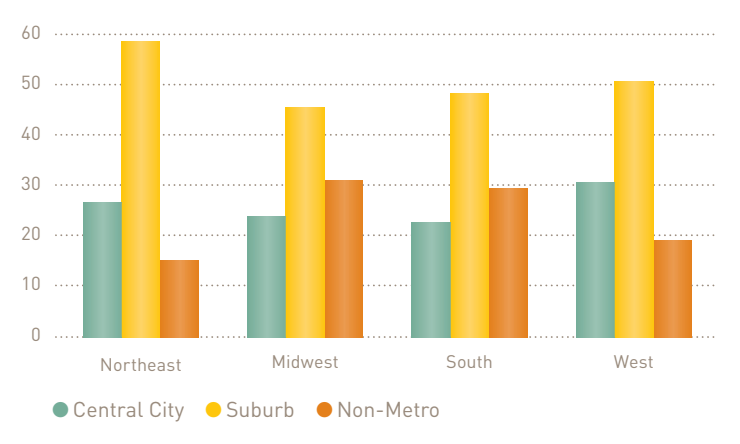
Distribution of Households Aged 50 and Over (Percent)

Source: JCHS tabulations of US Department of Housing and Urban Development, 2011 American Housing Survey.